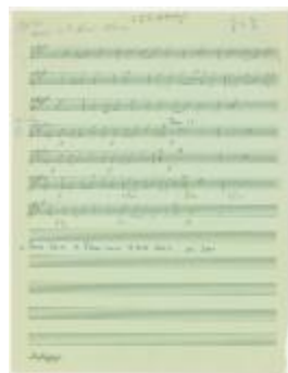
"Three to Get Ready", 1966 Score, 1.3A.03.045

"Three's a Crowd", 1950 – 1969 Score, 1.3A.03.046