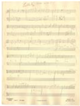
"Lullaby" lead sheet, 1941 Score, 1.3A.01.001b