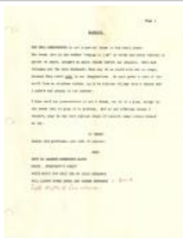
"Iola Brubeck's rehearsal book", 1962 Score, 1.3A.10.002