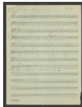
"Three to Get Ready", 1950 – 1969 Score, 1.3A.04.043

"Three to get ready", 1962 Score, 1.3A.22a.034