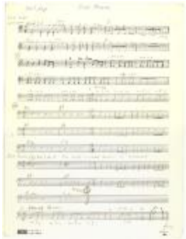
"Blue Rondo a la Turk", 1950 – 1969 Score, 1.3A.04.002