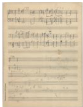
Darius Milhaud lessons, 1946 – 1947 Score, 1.3A.01.004

Desmond, Paul -- "Eleven Four", 1939 – 1998 Score, 1.3C.01.023