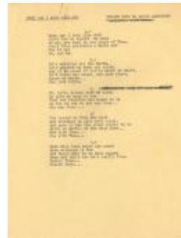
"They say I look like God", 1960s Score, 1.3A.08.014

"They say I look like God", 1960s Score, 1.3A.07.017