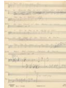
"They Say I Look Like God", 1960s Score, 1.3A.05.016

"Things That You Never Remember", 1970s Score, 1.3A.14.038