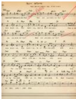
"Louis Armstrong's rehearsal book", 1962 Score, 1.3A.09.002