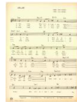
"Lord, Lord", 1950 – 1969 Score, 1.3A.03.027